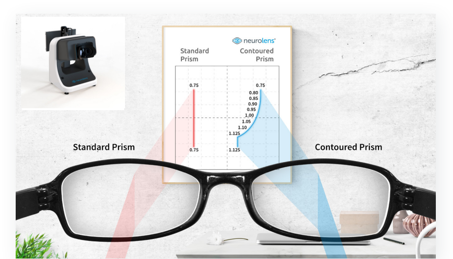
Figure 1: Contoured Neurolens design and the Neurolens Measurement Device, Gen 2 or NMD2 (inset).